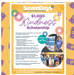
Seven Days Kindness Scholarship